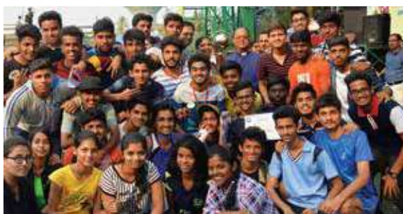
ZEST 2016 Winner (Mechanical Dept.)