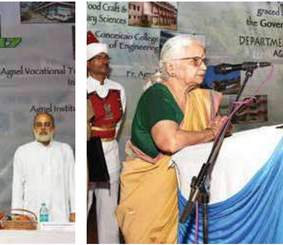
Hon. Governor's Address