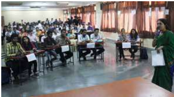
Quiz Competition Final Round