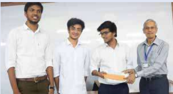
Technical Paper Presentation Winner