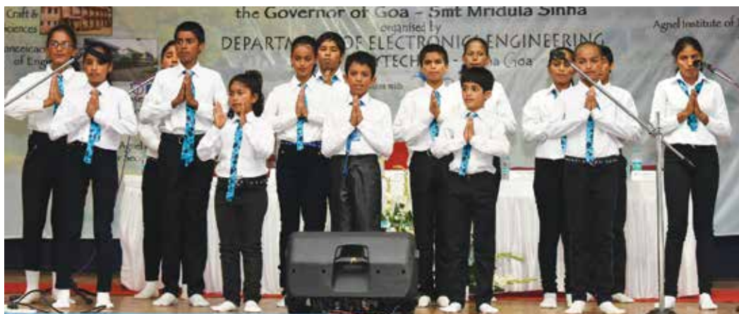
Balgram children with their welcome song