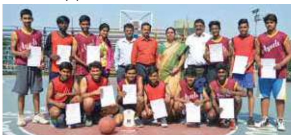
Zonal level Basketball winner