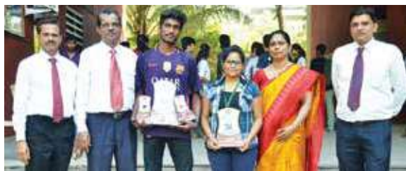
State level Athletics & Badminton Winners