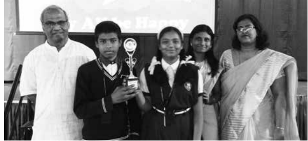
Trophy awarded to the best Class.