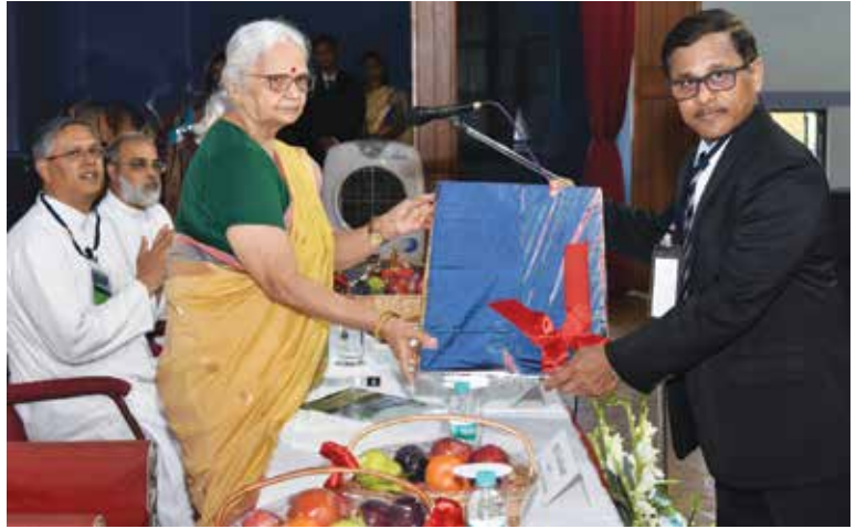
Presenting Hon. Governor with a Memento