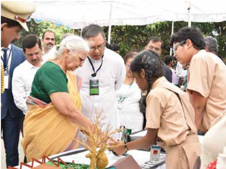
Project of School that got a National Award