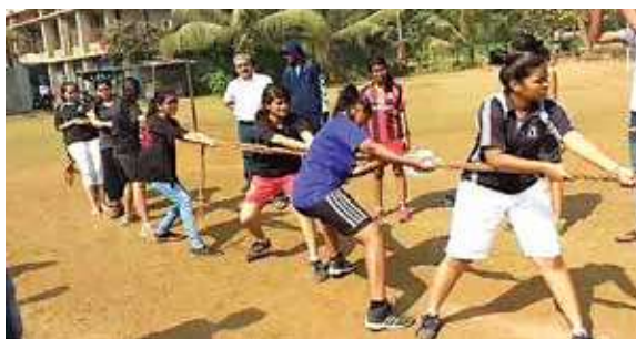
Tug of war