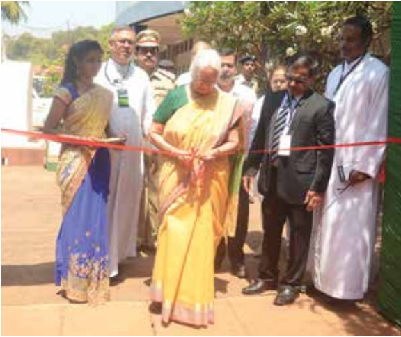
Inaugurating the Competition-cum-Exhibition