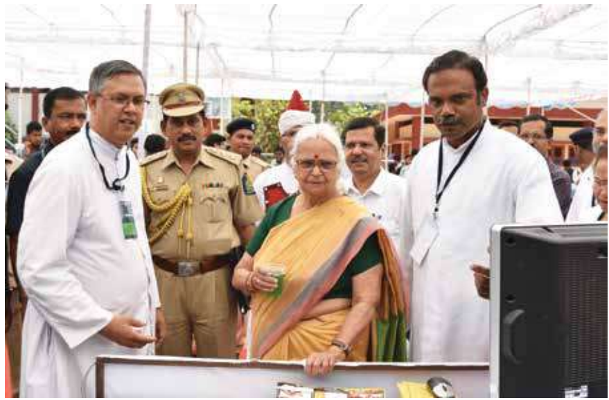
Curious about a project