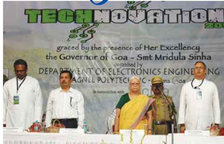
Salute to the Nation