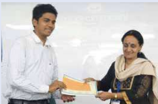
Technical Paper Presentation Winner