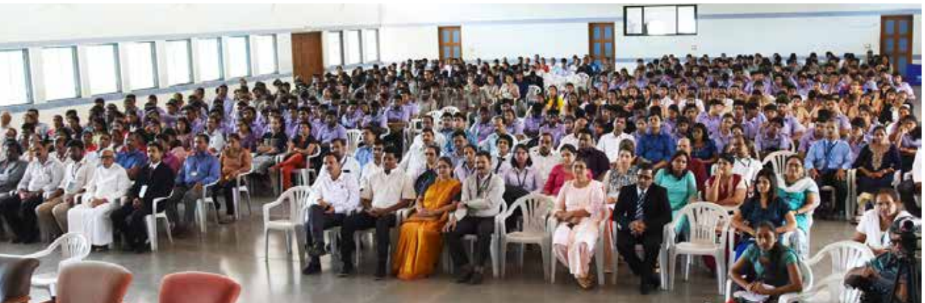
A Full House