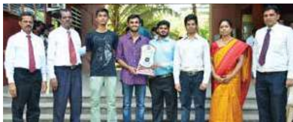
State level Table tennis Winners