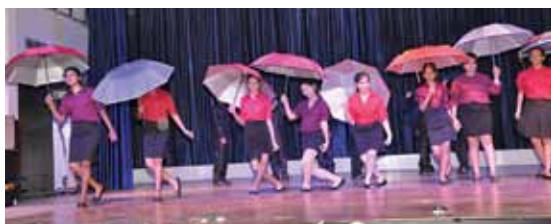
Scenes from the Opera - The Me Inside