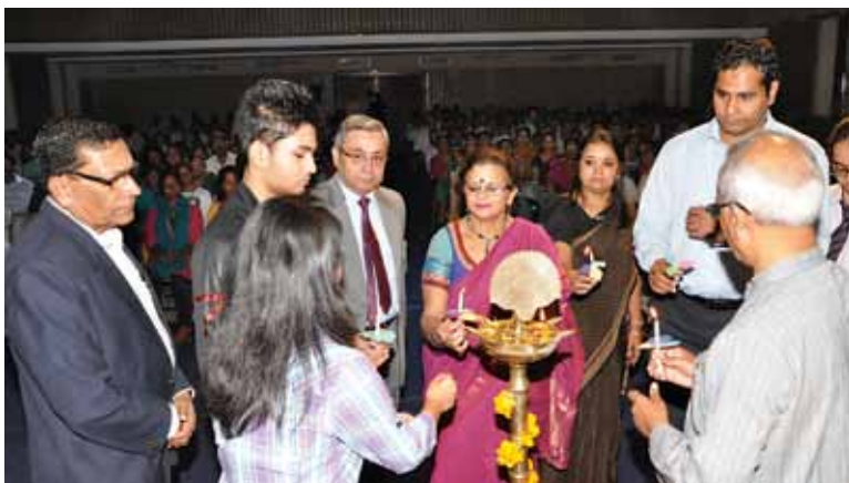
Lighting the Lamp