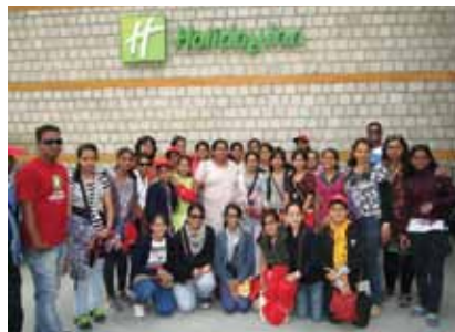
Fun at Holiday Inn