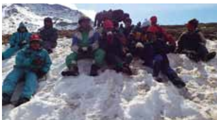
Frolicking in the snow