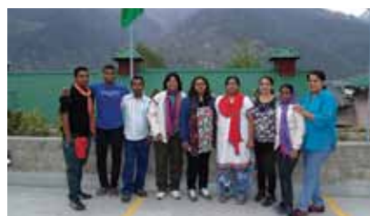
Our School Leaders