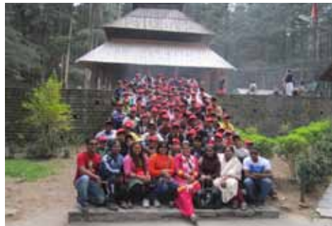
Agnelites at Hadimba Temple