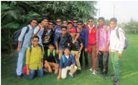
Best of Agnels at the Best Western Maryland