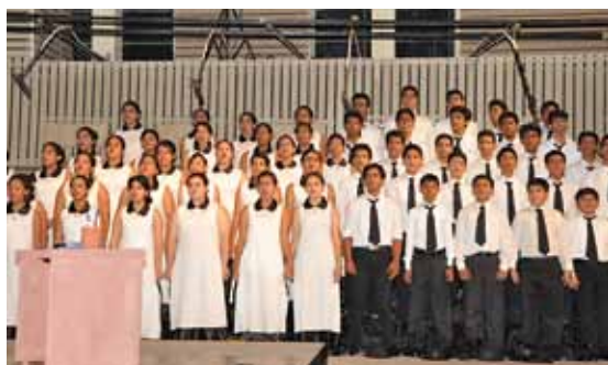
Singing in Unison - The Choir