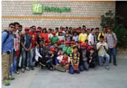
Together at Holiday Inn