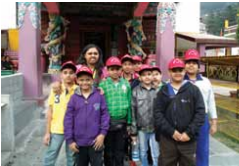
Architectural beauty of a Buddhist Monastery