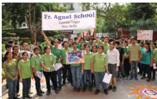
Delhi School Activity