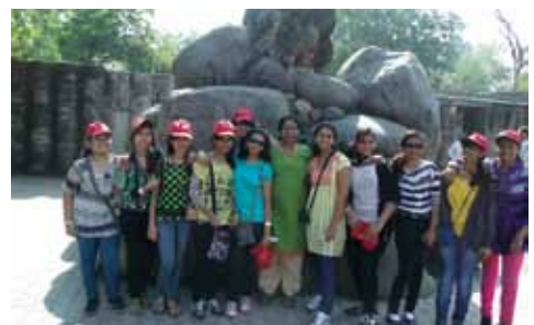
Rocking At The Rocking Garden - Chandigarh