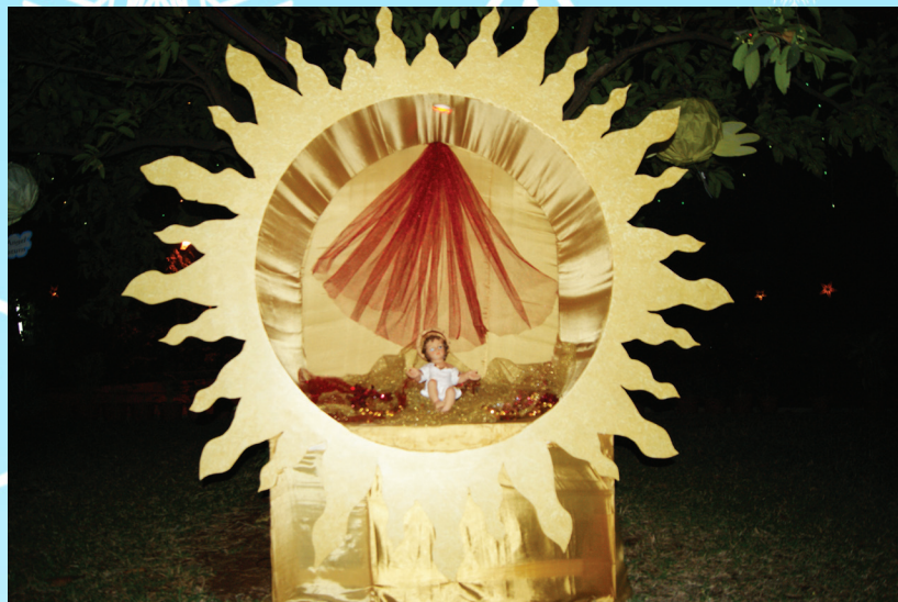
Brilliance of The Son