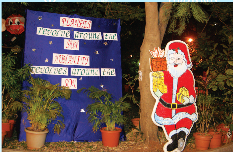
Christmas Gifts from Santa