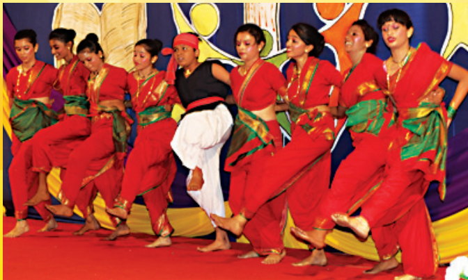
Welcome dance by students of Fr. Agnel Ambernath.