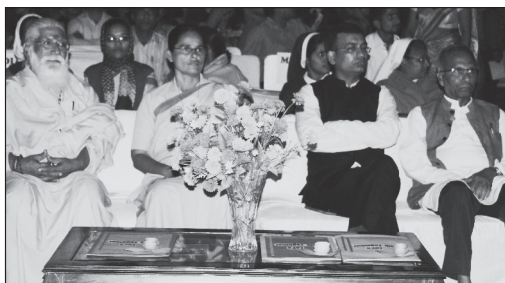
The Chief Guest and Invitees