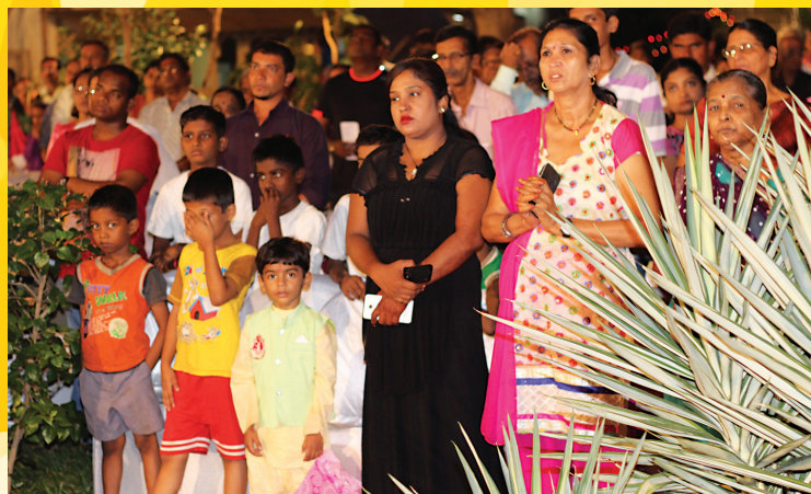
Devotees at Prayer