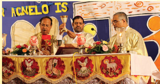
Bishop Theodore celebrating the Eucharist.