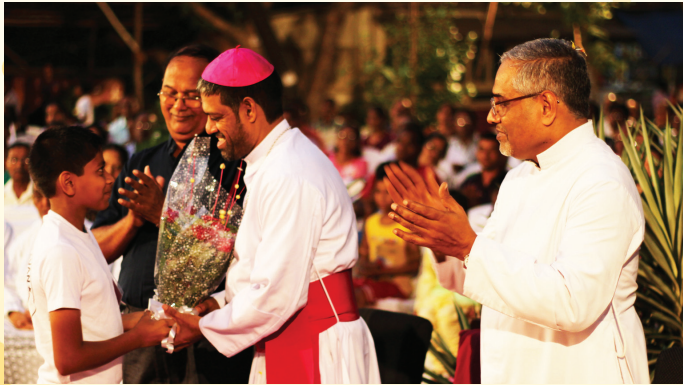
Bishop Theodore being welcomed.