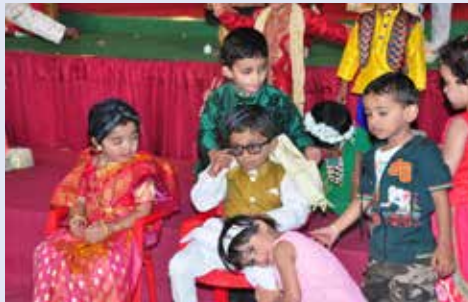
Nursery Tulip children skit on Grand Parents

The young Vidyankurians of Fr.Agnel's Vidyankur School, Pune celebrated Grandparents Day on 27th Oct. 2016 with exuberance and excitement to honour and give salutation to their beloved grandparents for their contribution to the society. The day witnessed participation of the students from Nursery, Lower and Upper Kindergarten who put up scintillating performances consisting of songs, dances and skits for their beloved grandparents. The day began with the Lighting of Lamp followed by the cultural show interspersed with games and riddles designed especially for our dear grandparents. Some of the grandparents even