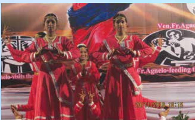
Fr. Agnel School, Ambernath