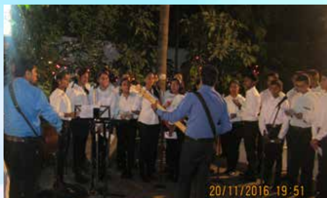
Fr. Agnel School, Ambernath, Choir