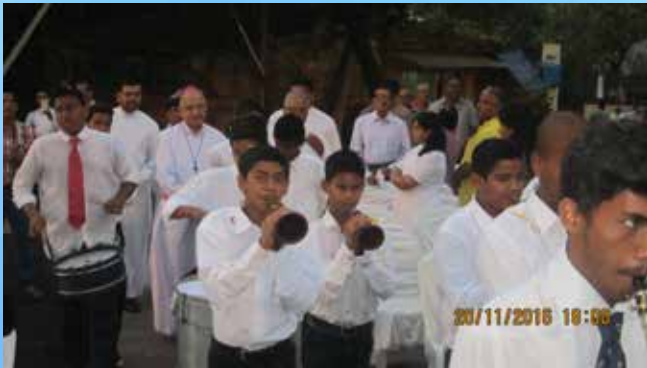
The entrance procession - Bishop Edwin Colaco along with the Clergy