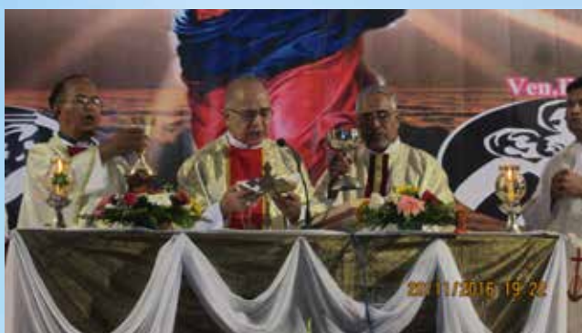
Bishop Edwin Colaco celebrating the Eucharist