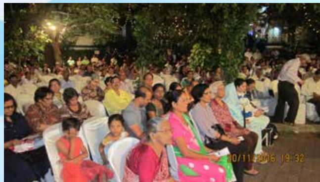
The faithful participating in the Eucharist