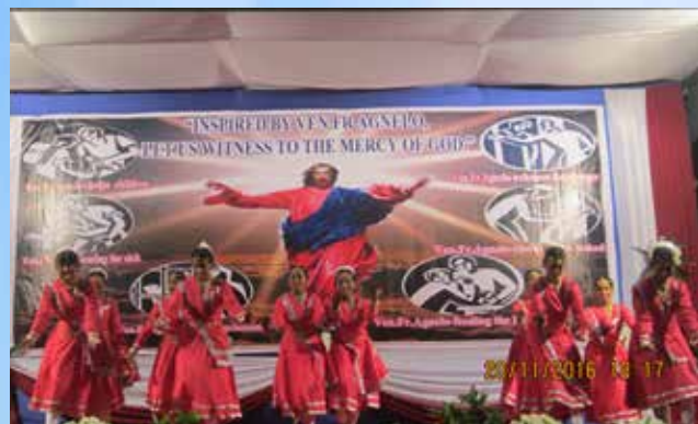
A prayer dance performed by