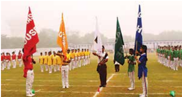
Students march ahead in full rhythm