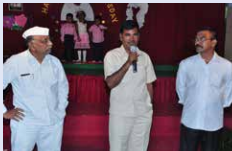
Grandfather's addressing the audience

with a gift as a token of love from the school. The success of the event was evident through the happy and joyful smiles and tearful eyes of the grandparents.