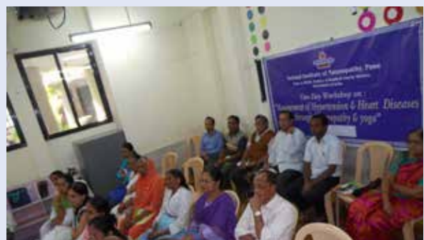
Participants of the 8th Wellness Lecture

Christmas is the day that holds all time together.