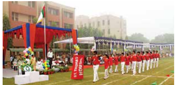
Houses present their March Past