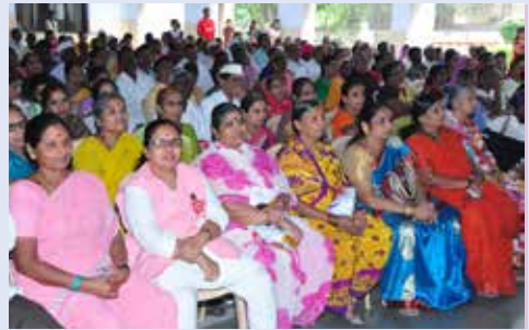
Grand Parents admiring their Grand children

addressed the gatherings with their words of wisdom. Every Grandparent was presented