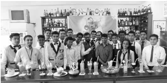
Bar Mixology Excellence Challenge.

The Annual Gastronomix 2016 for all Hotel Management & Catering Institute students was held on Wednesday 7th December 2016. A total of 9 Institutes of Hotel Management participated namely Institute of Hotel Management, Porvorim, V.M. Salgaoncar Institute of International Hospitality, Raia, Guardian Angel Institute of Hotel Management & Catering Technology, Curchorem, Goa College of Hospitality Education, Cidade De Goa, Dona Paula, IMBA, Goa University, Bambolim,