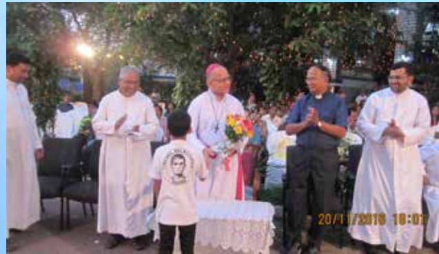
A Balbhuvan child welcomes Bishop Edwin Colaço with a bouquet of flowers