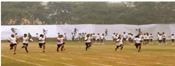
Senior Girls on the track