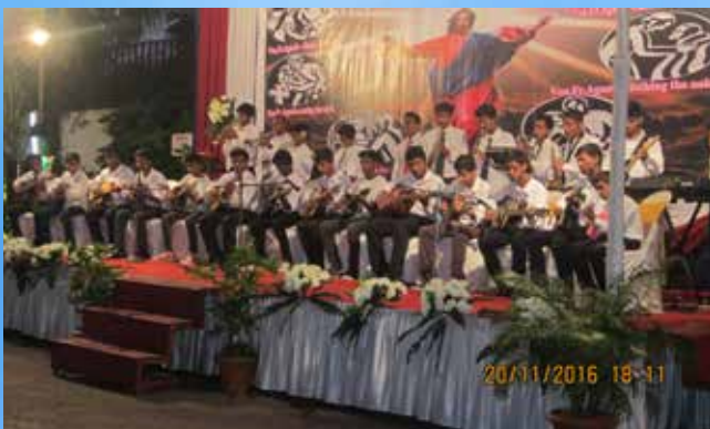
Instrumental Rendition by Balbhuvan children