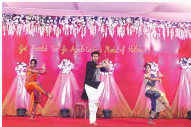
A prayer dance performed by