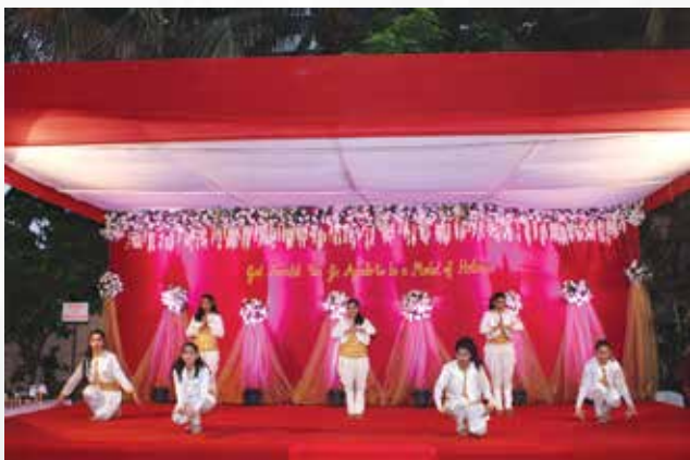
Fr. Agnel School, Ambernath