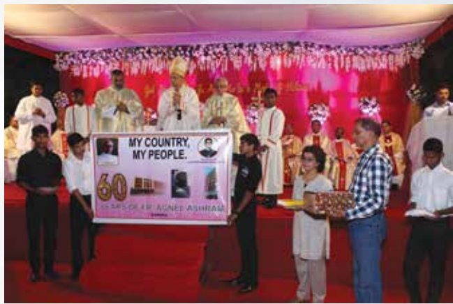
Celebrating 60 years of Ashram Foundation