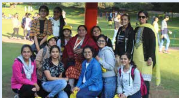
All smiling faces at the Botanical Garden, Ooty.