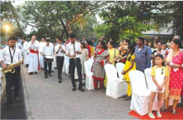
The entrance procession-Archbishop of Mumbai, Oswald Cardinal Gracias along with the Clergy