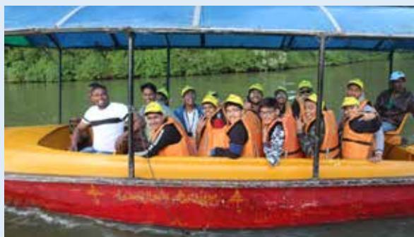
Agnelites enjoying the boat ride at Ooty lake.

Monarch Palace, Ooty was very comfortable and joyous as various fun filled activities like DJ session, bonfire, antakshri etc. were organized. Children's day was celebrated with a lot of fun game and entertaining programs for the students. The entire tour was well planned with visits to famous places like the Ooty lake , Botanical garden, Tea factory, Chocolate Factory etc. After enjoying the scenic beauty and an extremely pleasant weather of Ooty,