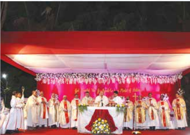
Archbishop of Mumbai, Oswald Cardinal Gracias celebrating the E