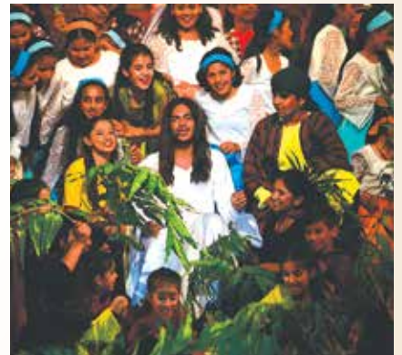
Jesus Christ the Superstar in action