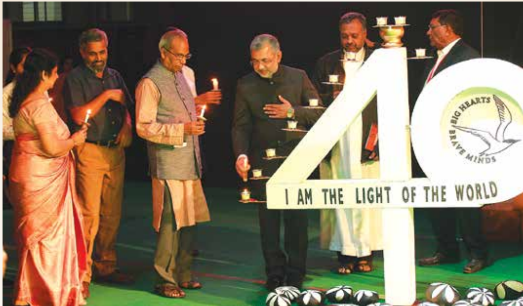
Justice Joseph Kurian lighting the lamp along with other dignatories