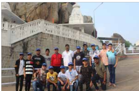
Seeking Blessings at Birla Temple