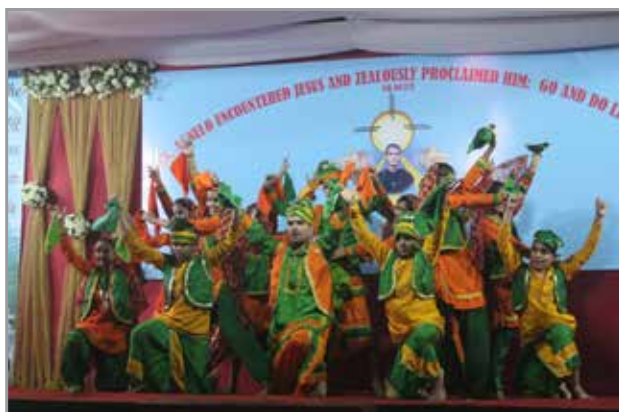
Punjabi Dance performed by Fr. Agnelo School, Ambernath.