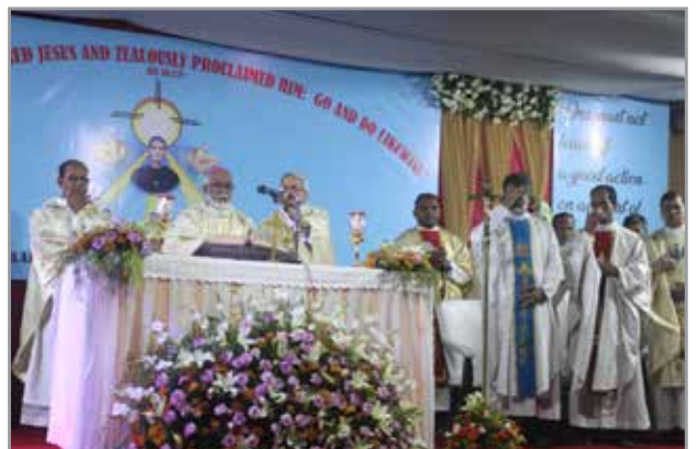
Bishop Salvador Lobo celebrating the Eucharist