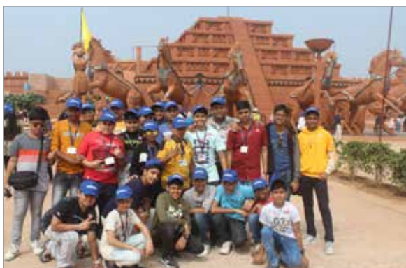
The Bahubalis at Filmcity