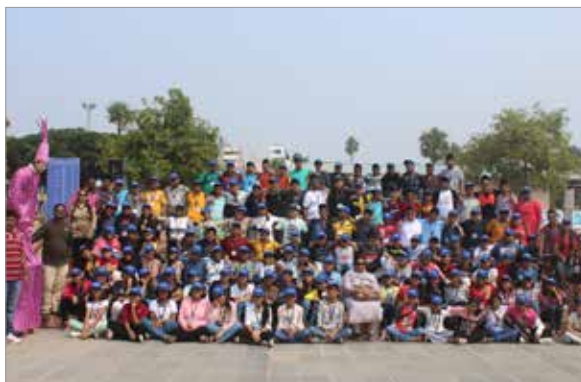
Zooming in the Zoo