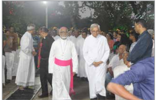
The Entrance Procession - Bishop Salvatore Lobo along with the Clergy