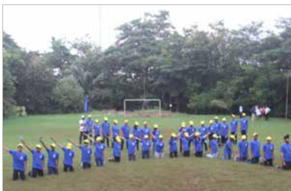
Precision on the Field