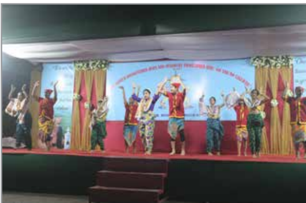
Koli Dance by Fr. Agnel School, Ambernath