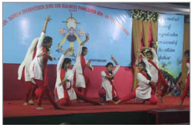
A Prayer Dance performed by Fr. Agnelo School, Ambernath.