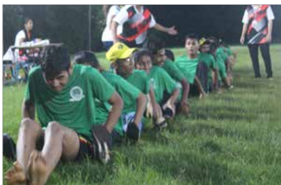
Going Caterpillar for the Cup.