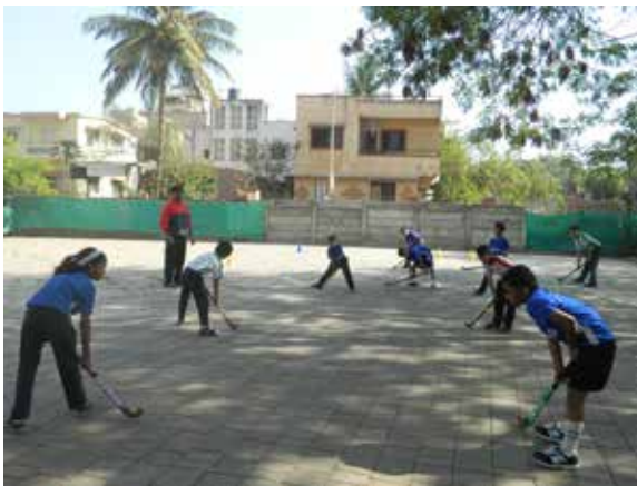
The National Game been trained by the coach.