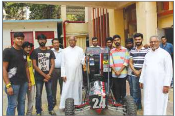
Bandra -Launching Engineering students' car project