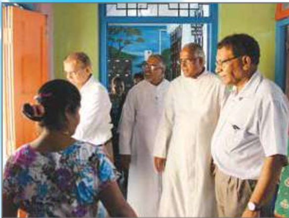
Bandra -Focussed look at Pre-Primary play station