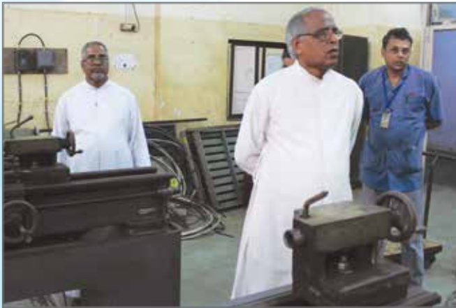
Bandra -Taking a deeper look at machine shop