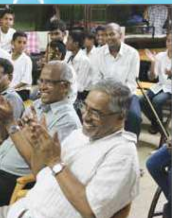
formance by Balbhuvan children