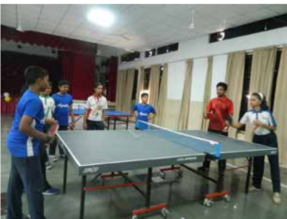
Table Tennis- Agility and Coordination.