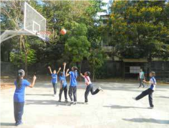
Basket ball- the technique of shooting.