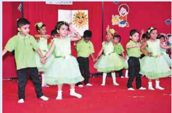
Nursery kids dancing to the tune of 'life is a beautiful journey'.

The School Report was presented highlighting