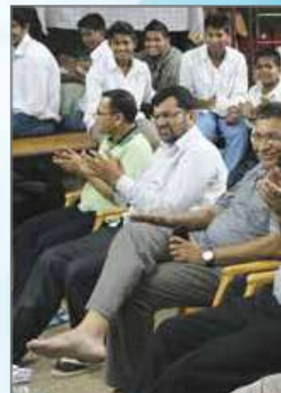
Bandra -Enjoying perform