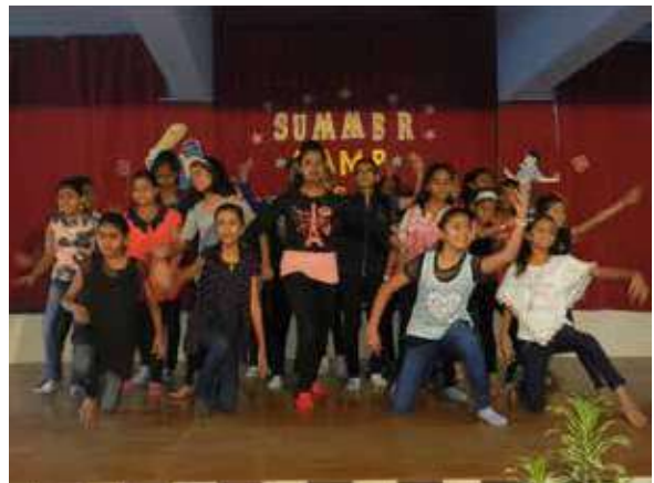
Sports Dance Performed by the Children