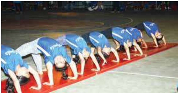
Bend it like a bow- Gymnastics