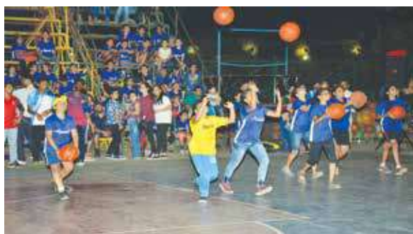
Take it to the Net