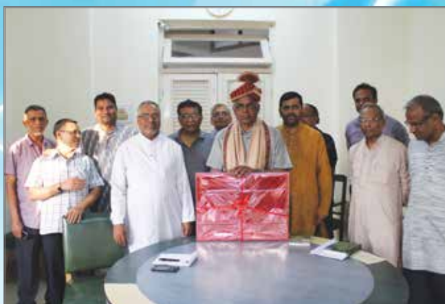
Bandra -Becoming all things to all men