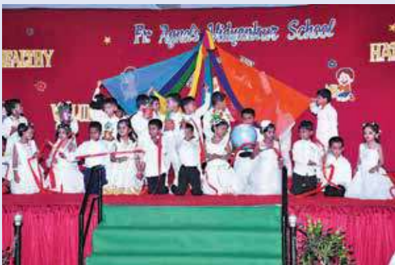
'Heal the World ' a message given by UKG kids.

T he summer camp, an annual feature at Fr.Agnels, Vashi was conducted between 8th and 30th April 2017 in the Agnel Sports Complex. Other than the usual sports like athletics, football, gymnastics, basketball, badminton, chess, hockey, table tennis, kabaddi, kho-kho, lawn tennis, skating, swimming and shooting, the camp had new sports like baseball, golf and archery this year. The camp encourages students to use their time constructively and engage in a sporting activity of their choice. The camp aims at overall development of children and helps to discover young talent. A whopping 1,059 students availed the various facilities. 222 students grabbed the opportunity to learn swimming. 66 students opted to learn golf. The camp was a hit with students and parents.