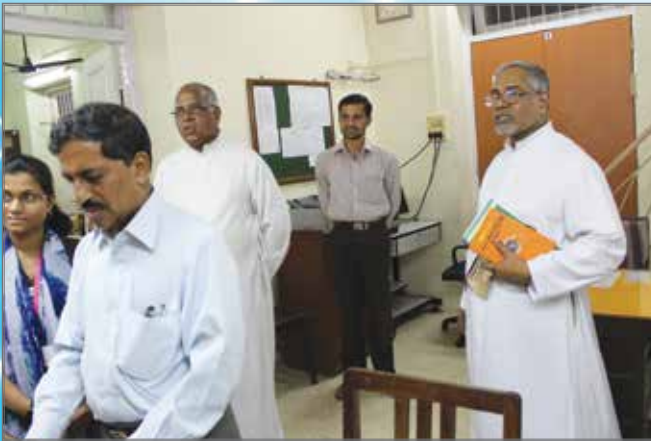
Bandra -Inspecting Ashram Office Management System