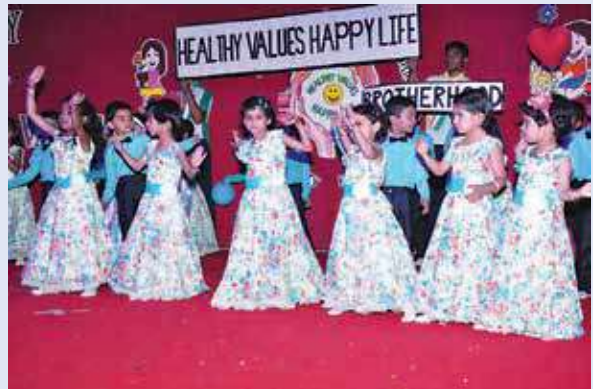
Dancing To The Tune Of The Theme 'Healthy Values Happy Life' By LKG kids.

the achievements of students in various fields. The function was well appreciated by all the parents and the Management. The function came to a close with the rendition of the School Anthem.