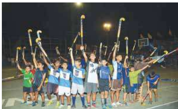
Some dream about goals, we make them