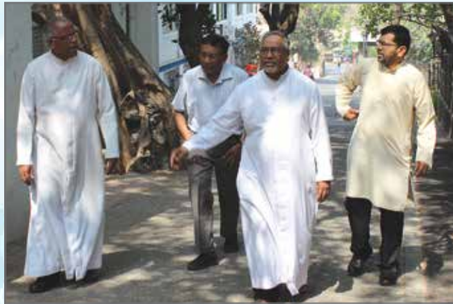
Bandra - Visit to various institutions