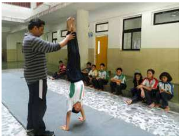
Technique of Balancing