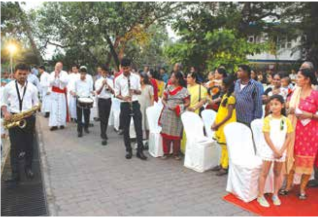
The entrance procession-Archbishop of Mumbai, Oswald Cardinal Gracias along with the Clergy