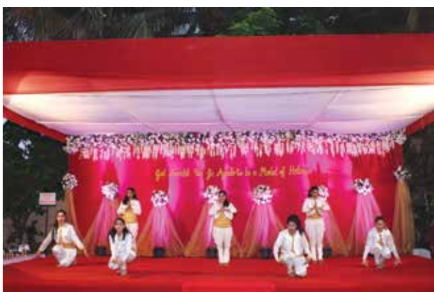
Fr. Agnel School, Ambernath