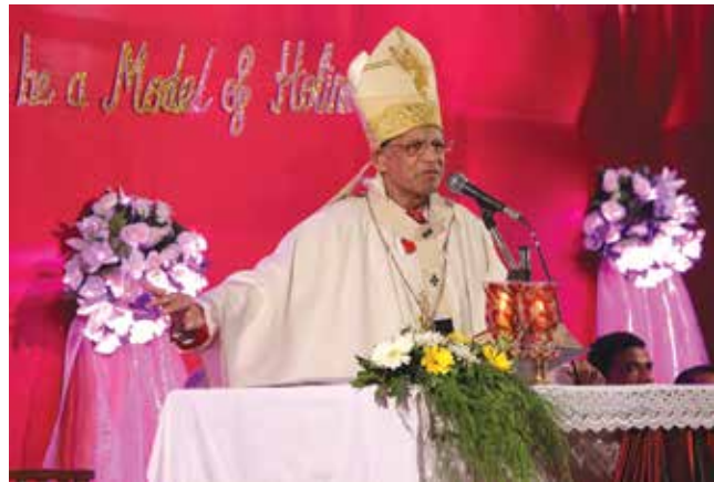
Archbishop of Mumbai, Oswald Cardinal