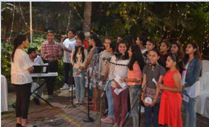
Choir with Melodious Voices