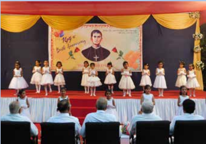
Prayer Dance by the Children of Fr. Agnel School, Vashi