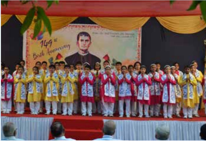
Prayer Song by Vashi Students