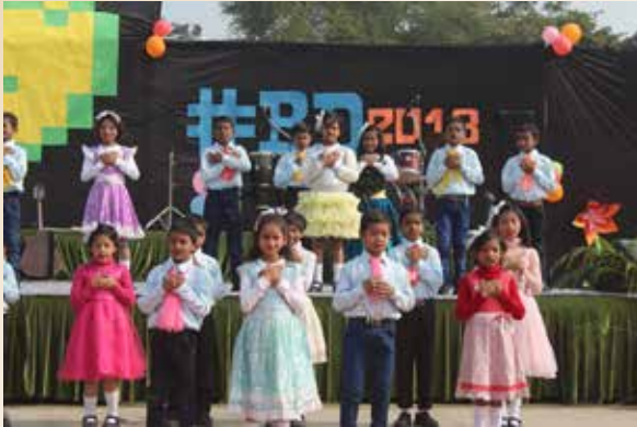
The Action Song by Class I & II