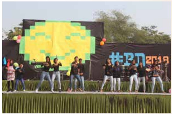
Dance performed by Surabhi House Children