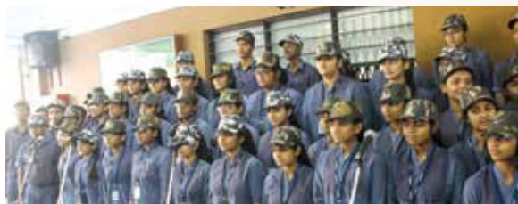
Patriotic Song by Jr. College Students

The honour of hoisting the flag on this auspicious occasion, was awarded to Mr. and