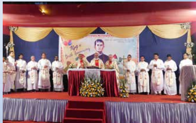
Concelebrated Mass with the Bishop