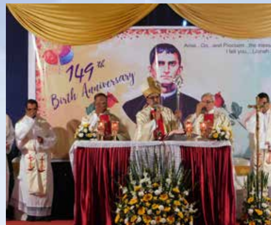
Bishop Imparts his Blessing to All