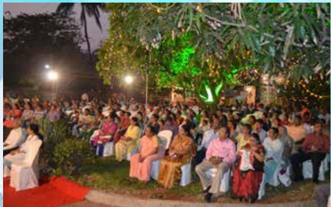
Audience listening to Inspiring words of the Bishop