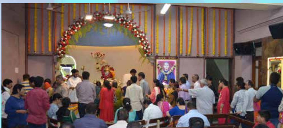
Kiss of Relic Near the Tomb