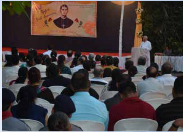
Superior Welcomes the Gathering