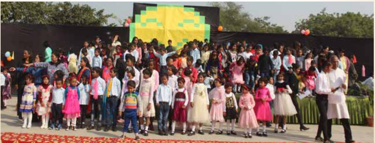
The Final Thank You Prayer followed Prayer Before Meal