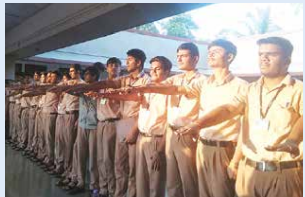
Students take pledge