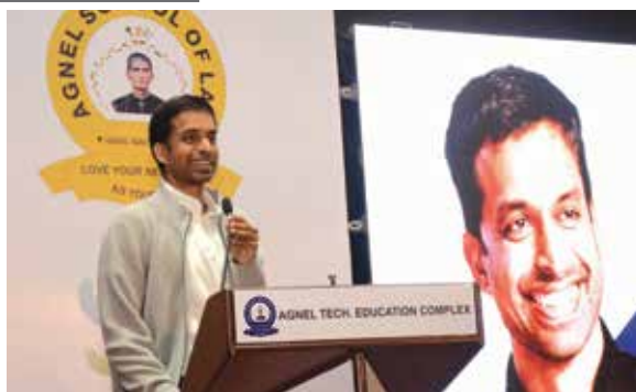
Speaking about the importance of sports in school curriculum.