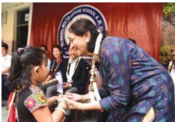
Wherever you visit, let it be your joyful and memorable experience.