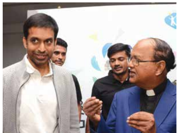
Inauguration of Badminton Gurukul.