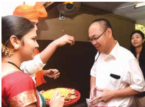
Traditional Welcome to the Japanese.