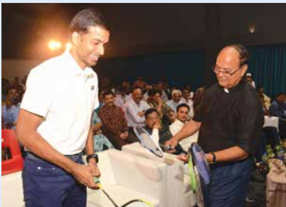
Getting ready for the playoff game.