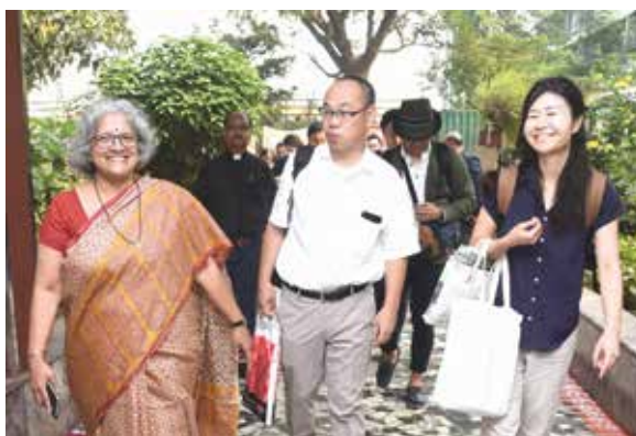
Thanks to photography, some memories remain