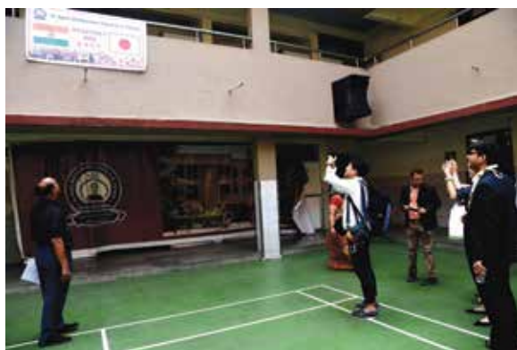
Capturing the feeling of every moment.