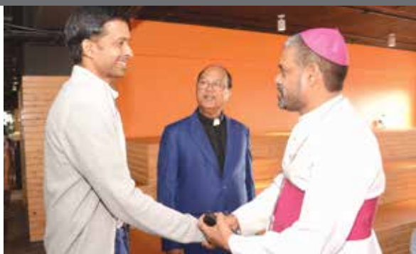
Smile is the universal Welcome.