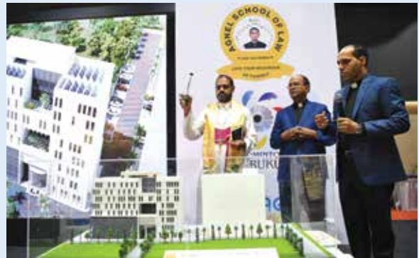
Rev. Bishop blesses Agnel School of Law.

curriculum. He said, “We must give importance to physical literacy because today’s challenges are different”. The trainees in the academy will be exposed to a special curriculum designed by Mr. Gopichand himself. The academy is spread on an area of 6300 sq. ft. and consists of 4 courts of international standards. All facilities conform to the standards prescribed by the Badminton World Federation. The special PULASTIC flooring