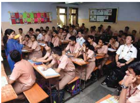
Observing teaching in the classroom.