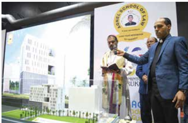
Rev. Bishop invoking blessings from the Almighty.