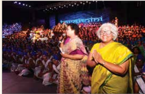
Principal and Vice Principal