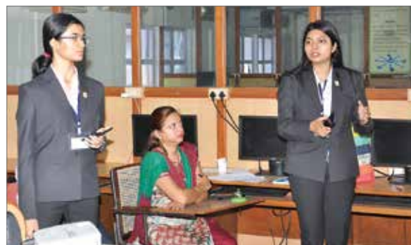
Session in one of the venues