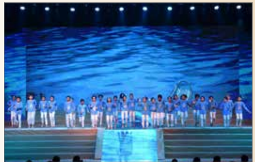
Going to the river