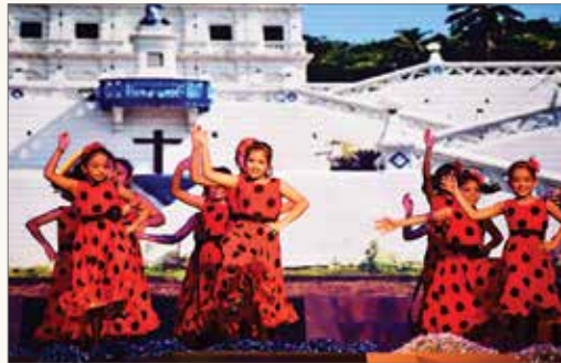
People of Goa