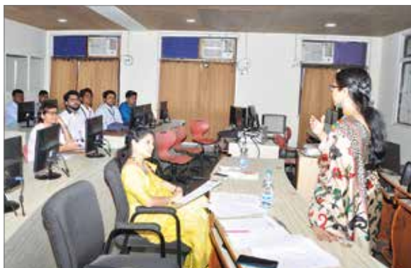
Session in venue 2