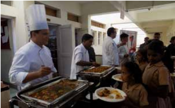
Sampling the delicious cuisine