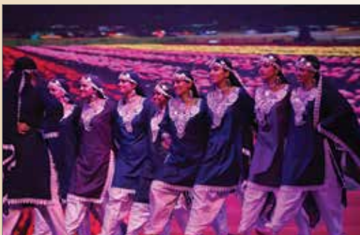
Kashmiri Rauf Dance