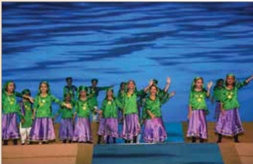
People of Maharashtra