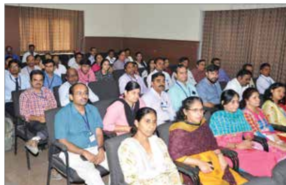
Audience during inauguration on 20th December 2019