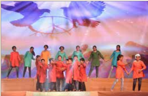
Song of Aid