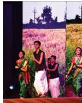
People of M