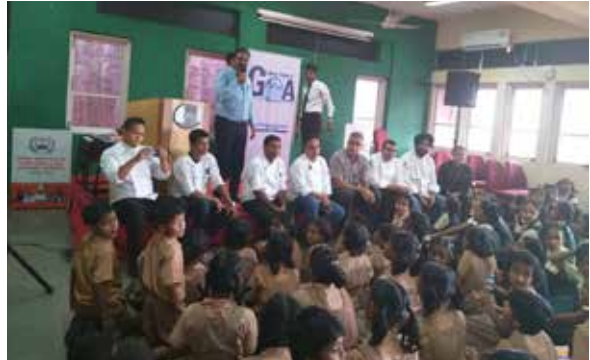
A demo for an avid audience