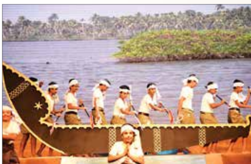
Kerala Boat race