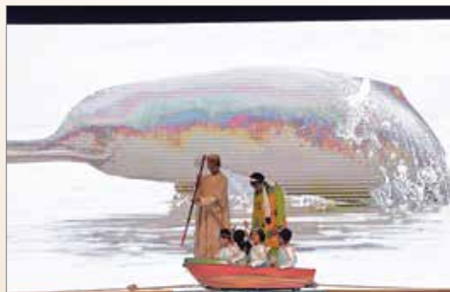
Dolphin in River Beas