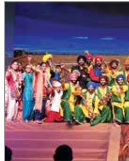
People of O