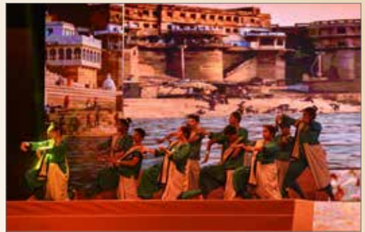
Ganga Behti ho Kyon