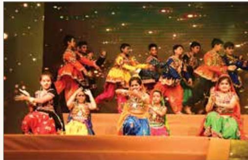
People of Gujarat