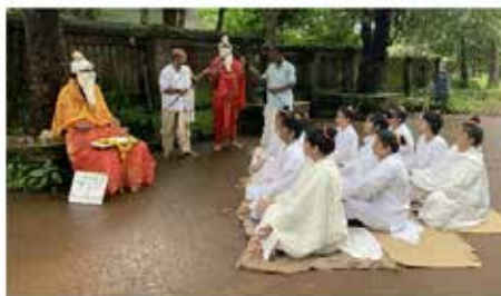
PIC 1: Gurukul