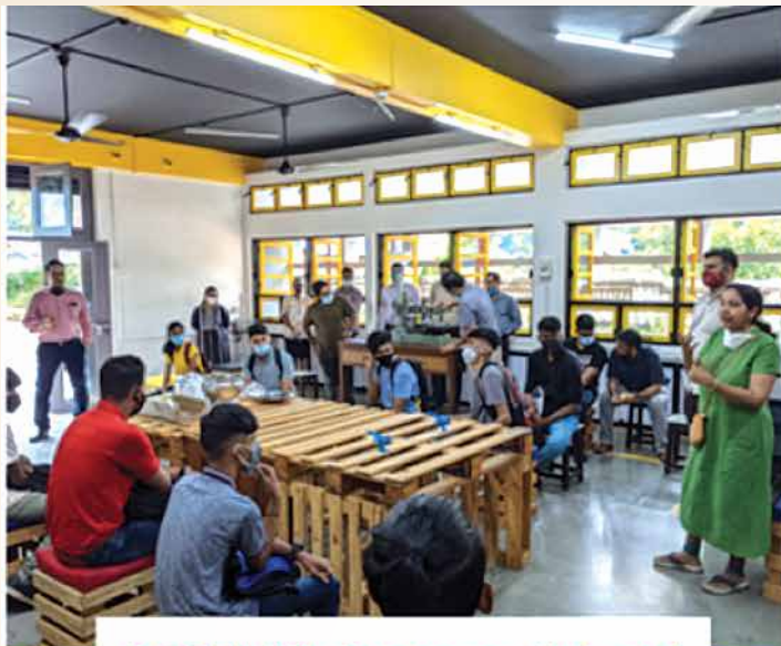
PCCE's Machining and Rapid Prototyping Center (MARC)