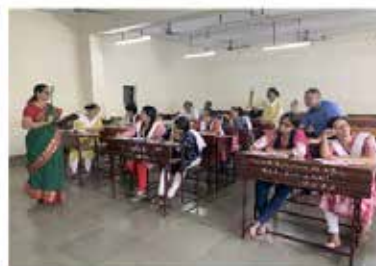
PIC 2: RetroSkool

previous year. The students organized various cultural programs and games for the teachers.