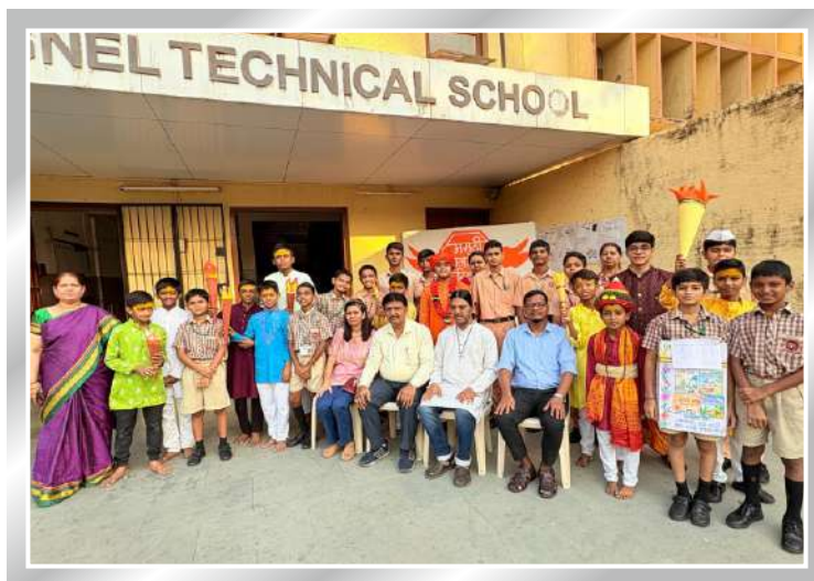
Making Marathi Diwas meaningful at Fr. Agnel Technical High School, Bandra.