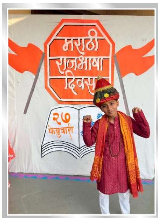
Keeping rich traditions alive at Marathi Diwas.