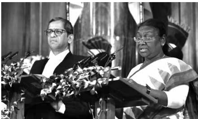
The Chief Justice of India, Shri Justice N.V. Ramana administering the oath of the office of the President of India to Smt. Droupadi Murmu, at a swearing-in ceremony in the Central Hall of Parliament, in New Delhi on July 25, 2022.

Naidu, Prime Minister Narendra Modi and Congress president Sonia Gandhi were present at the ceremony.