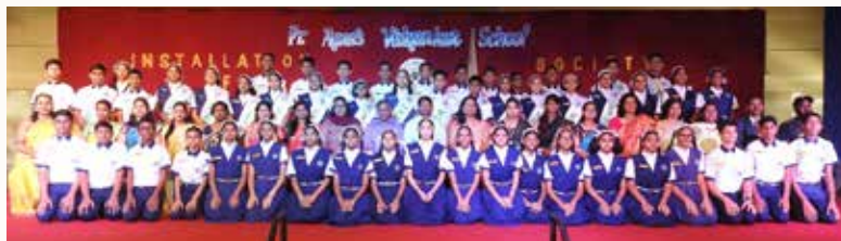
Members of the newly installed Senior Parliament.