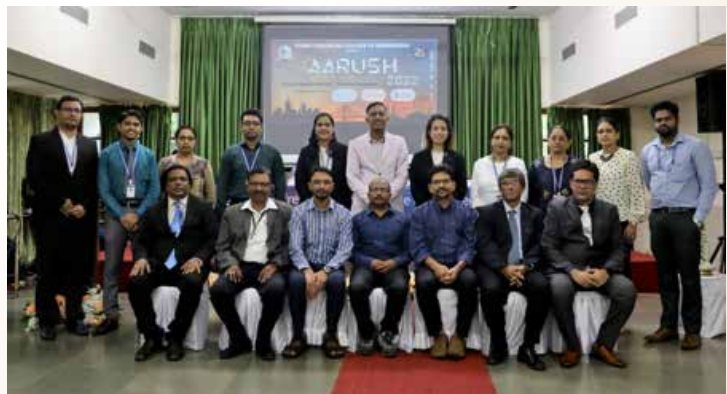
Dignitaries at AARUSH 2022.

keynote speakers, twelve alumni technical sessions, eight workshops, five entrepreneurship sessions,