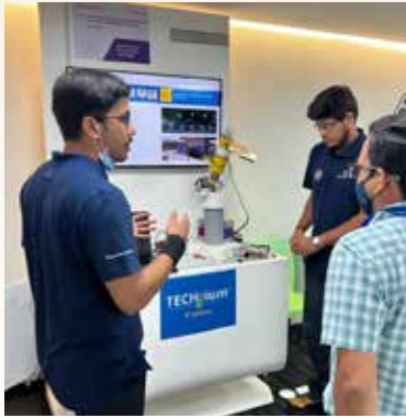
Finalists of TECHgrium® 5th Edition.