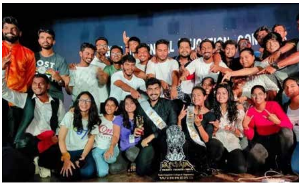
The Computer Department of Engineering emerged victorious, thereby winning the title of Mithya 2022.