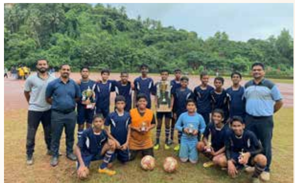
The winning football team and officials of Fr. Agnel Multipurpose High School, Verna, Goa.

The tournament saw the participation of 12 teams, from all across the state. Fr. Agnel