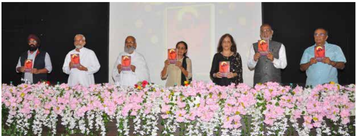
Dignitaries at the book launch.