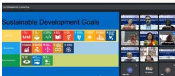
Inaugural Address - Chief Guest