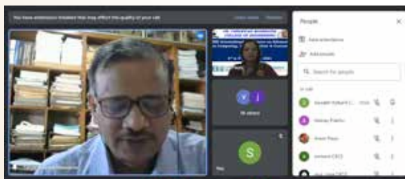
Inaugural Address - Guest of Honour