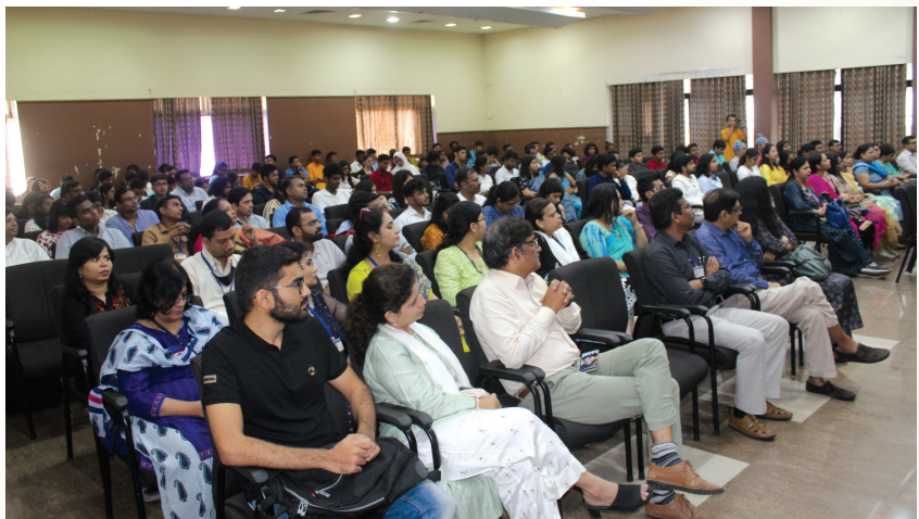
A section of the audience at the Conceicao Rodrigues Memorial Debate (CRMD).

the theme, The Indian Agenda: Global Influence and Dominance . This intermediate Oxford-style debate competition had 32 laudable teams from all over India eagerly anticipating bagging the esteemed trophy with their debating intrepidity, grappling with their words for the first prize of Rs. 30,000, the second prize of Rs. 15,000, and Rs. 5000 for the best speaker and the best adjudicator. Teams from prestigious institutions like IIIT (Raipur), NMIMS (Mumbai), NIFT (Mumbai), Gokhale Education Society's Law College (Kharagpur), and Symbiosis Centre for Management