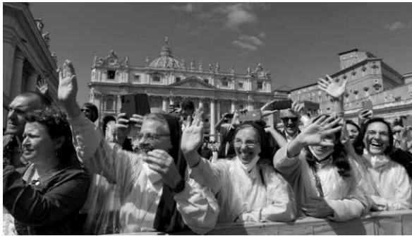
Pilgrims attending the beatification of Pope John Paul I

When we look upon the Crucified Lord, the Pope continued, we are called to overcome the focus on ourselves, to love God and others everywhere, even those who see things differently, even our enemies.