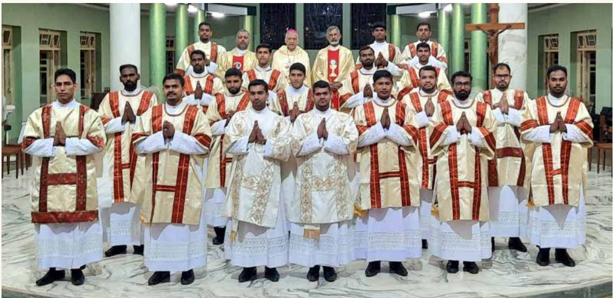
The Society of the Missionaries of St. Francis Xavier (SFX) ordains 19 new priests.