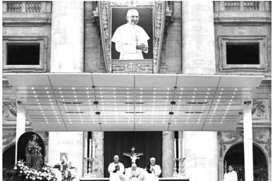
Beatification of John Paul I in St. Peter's Square

as "this is not the style of Jesus...and cannot be the style of his disciples and of his Church."